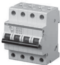
S204-B, 4 pole S203-BNA, 3P+N