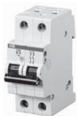
S202-B, 2 pole S201-BNA, 1 P+N