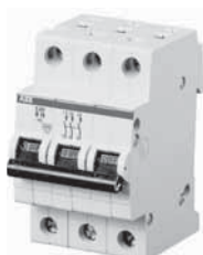
S203-B, 3 pole